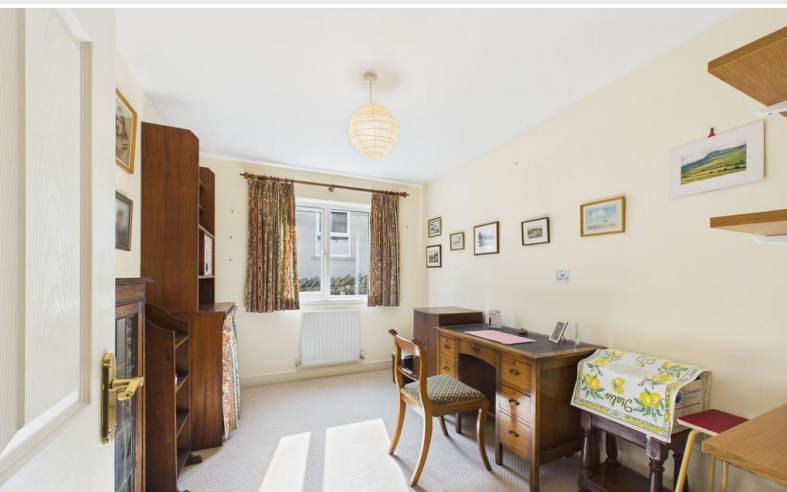
Bedroom Four / Study