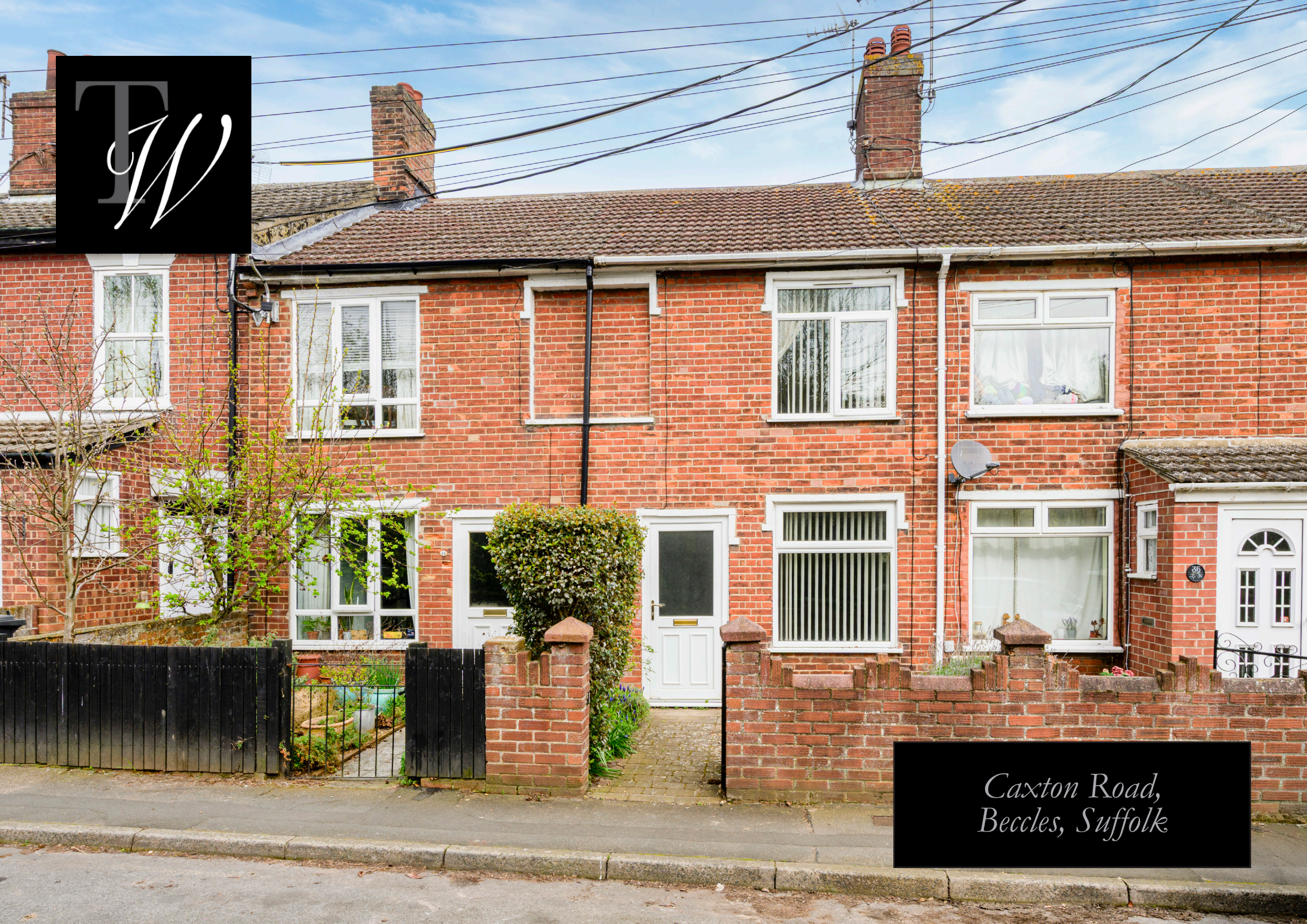
Caxton Road, Beccles, Suffolk