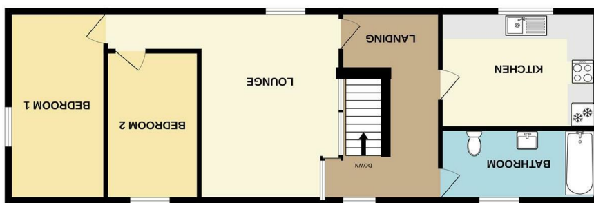
TOTAL FLOOR AREA : 822 sq. ft. (76.4 sq. m.) approx. Made with Metropix ©2026