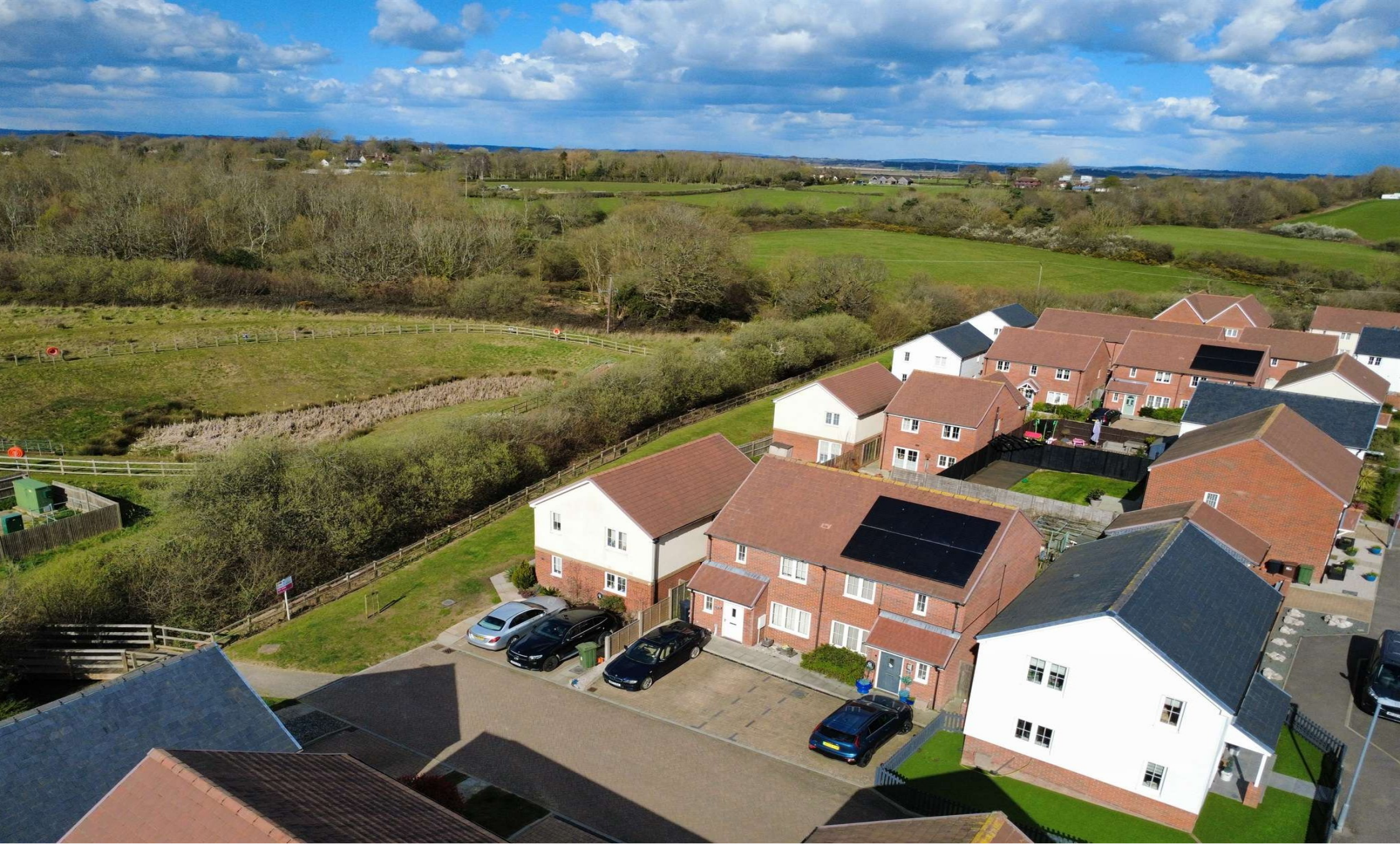
Sorrel Place, Stone Cross Pevensey BN24 5GU