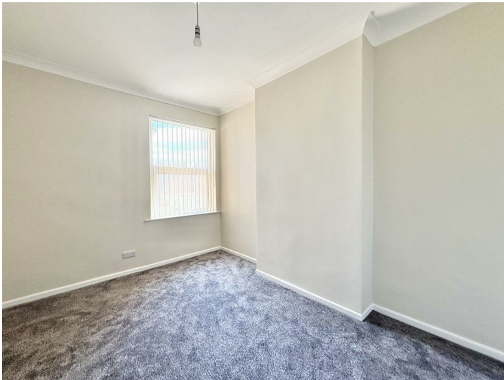
Bedroom Two 12'3" x 9'1" (3.74 x 2.77)