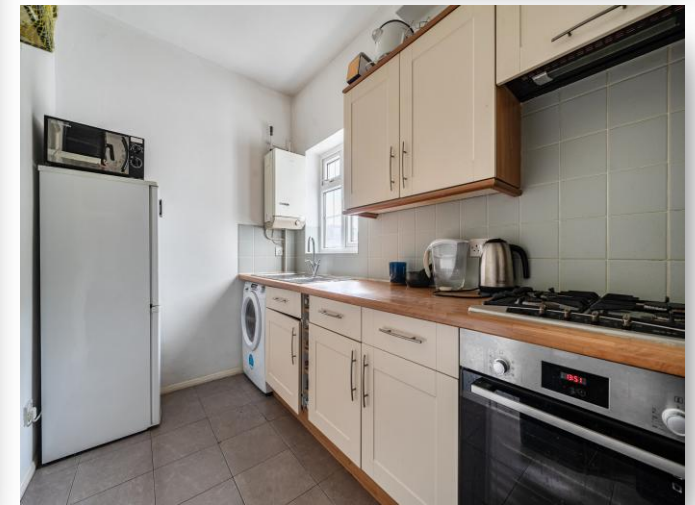
Flat 1, 42 Forlease Road, Maidenhead SL6 1RU