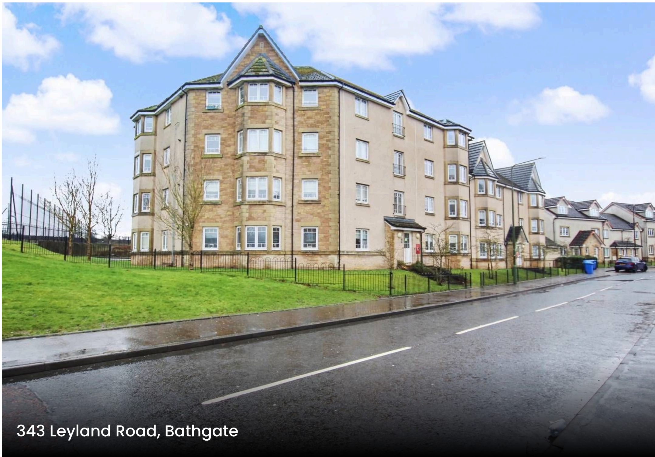
343 Leyland Road, Bathgate