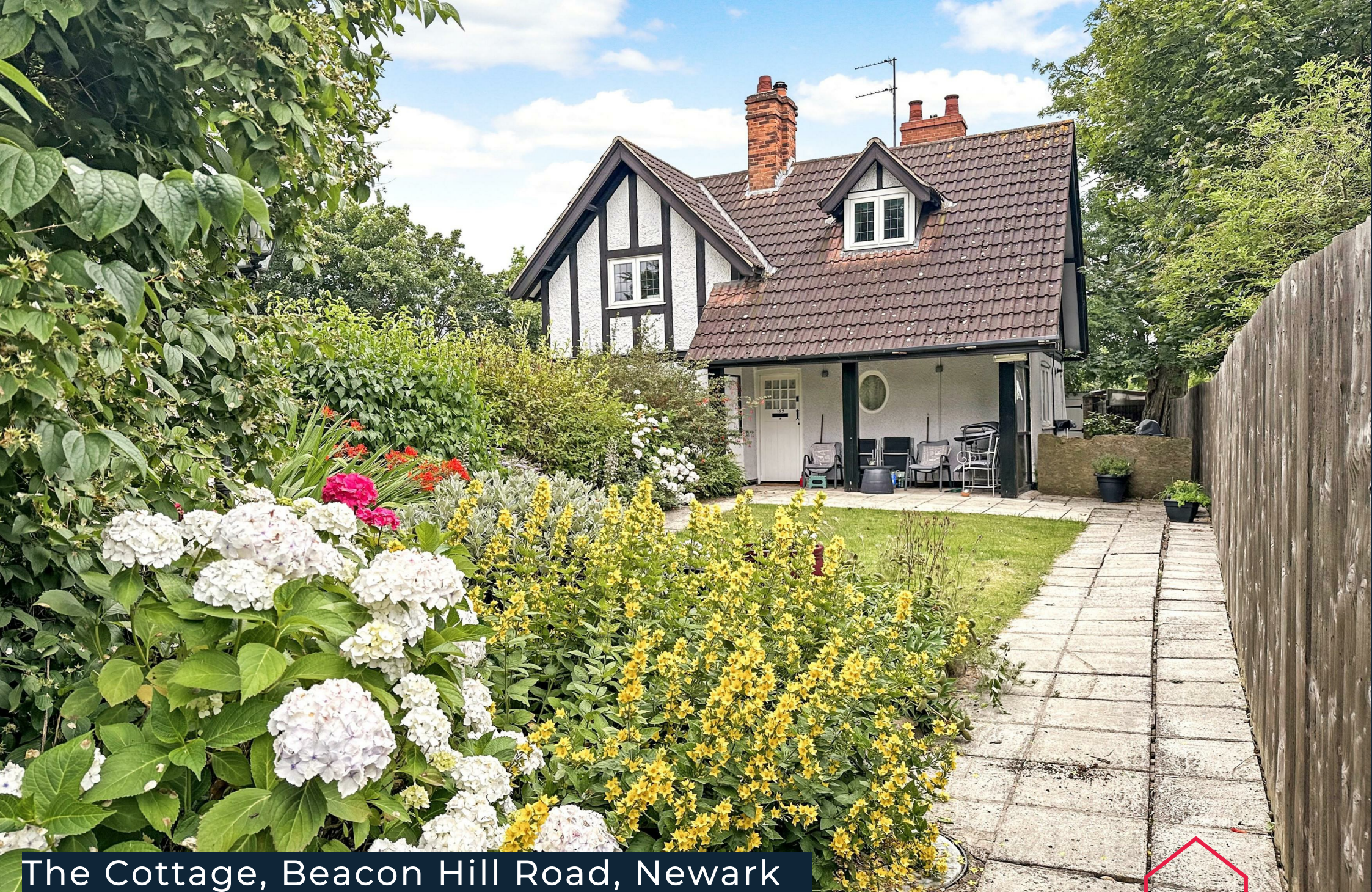
The Cottage, Beacon Hill Road, Newark