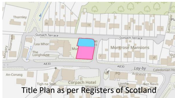
Title Plan as per Registers of Scotland

Viewing: Viewing strictly by appointment through the selling Agent.