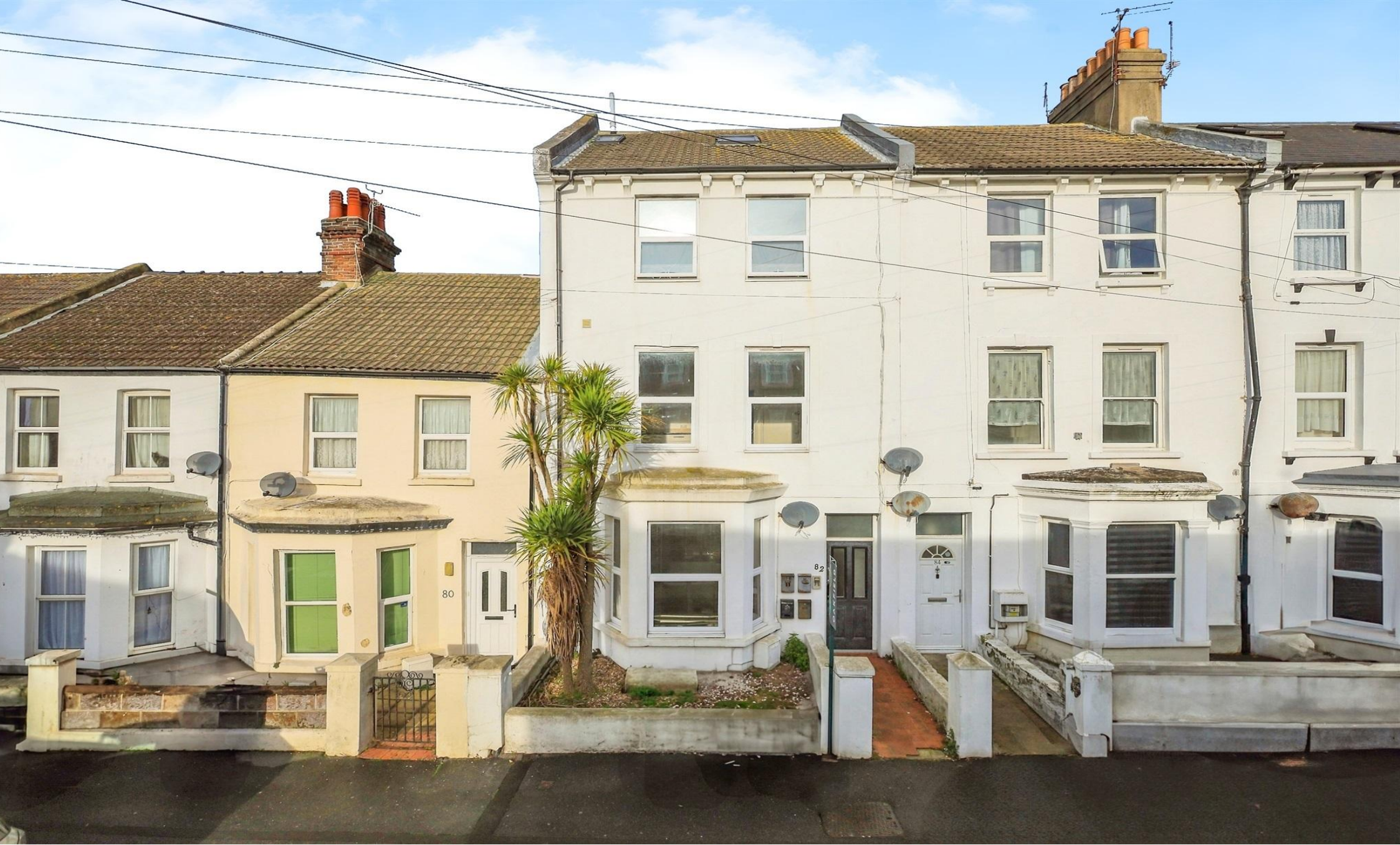
Longstone Road, Eastbourne BN21 3SL