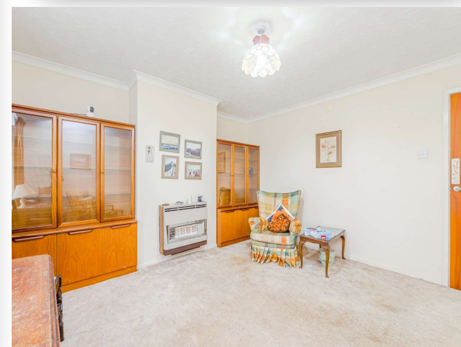
Ontario Way,Lakeside Cardiff CF23 6HB