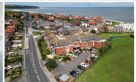
29 FAIRWAYS COURT, WHITBY- 1 bed Apartment -£147,500