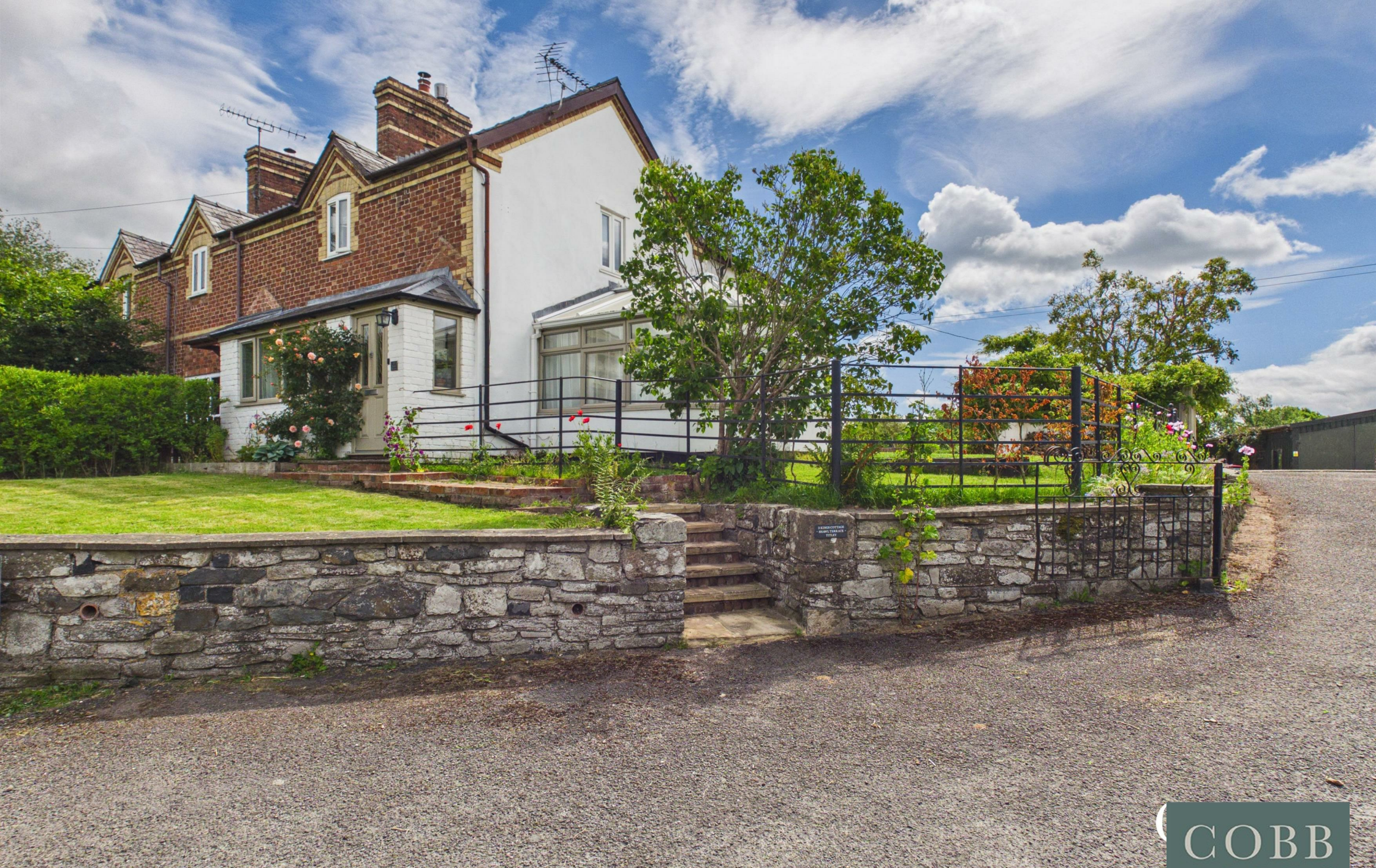
Kings Cottage, 3, Shawl Terrace, Titley, HR5 3RJ Price £475,000