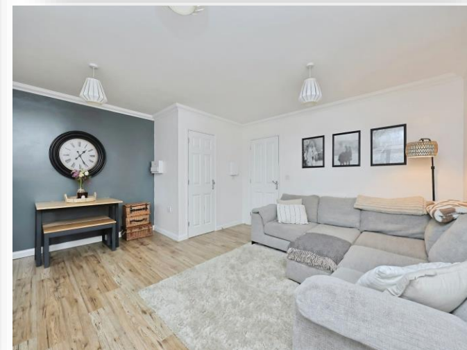
Heron Close, Sprowston, Norwich, NR7 8DQ