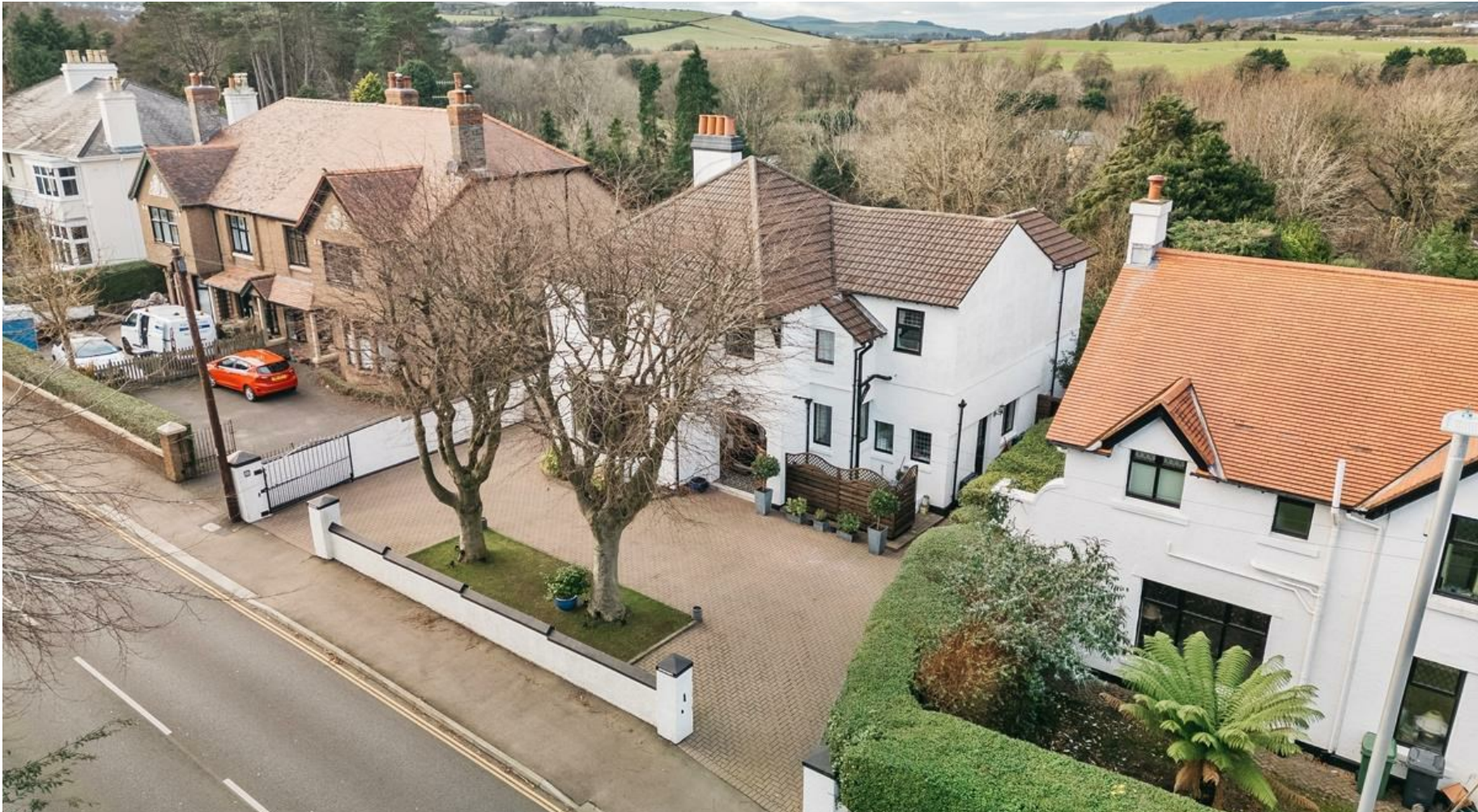
Moorcroft Quarterbridge Road, Douglas, Isle Of Man, IM2 3RL Asking Price £865,000