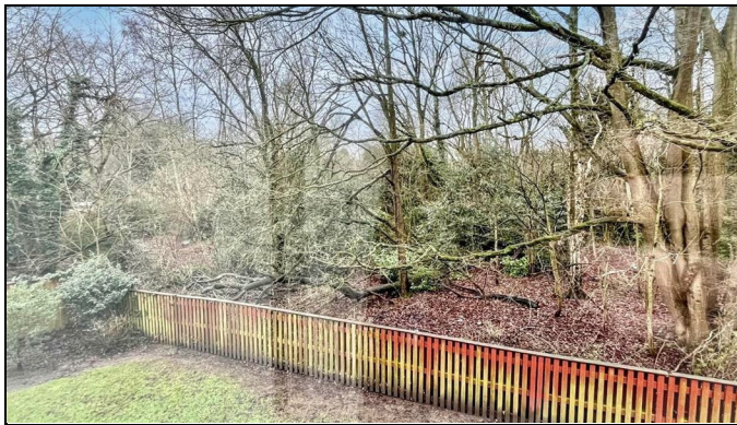
Trident Close, Sutton Coldfield, B76 1LF