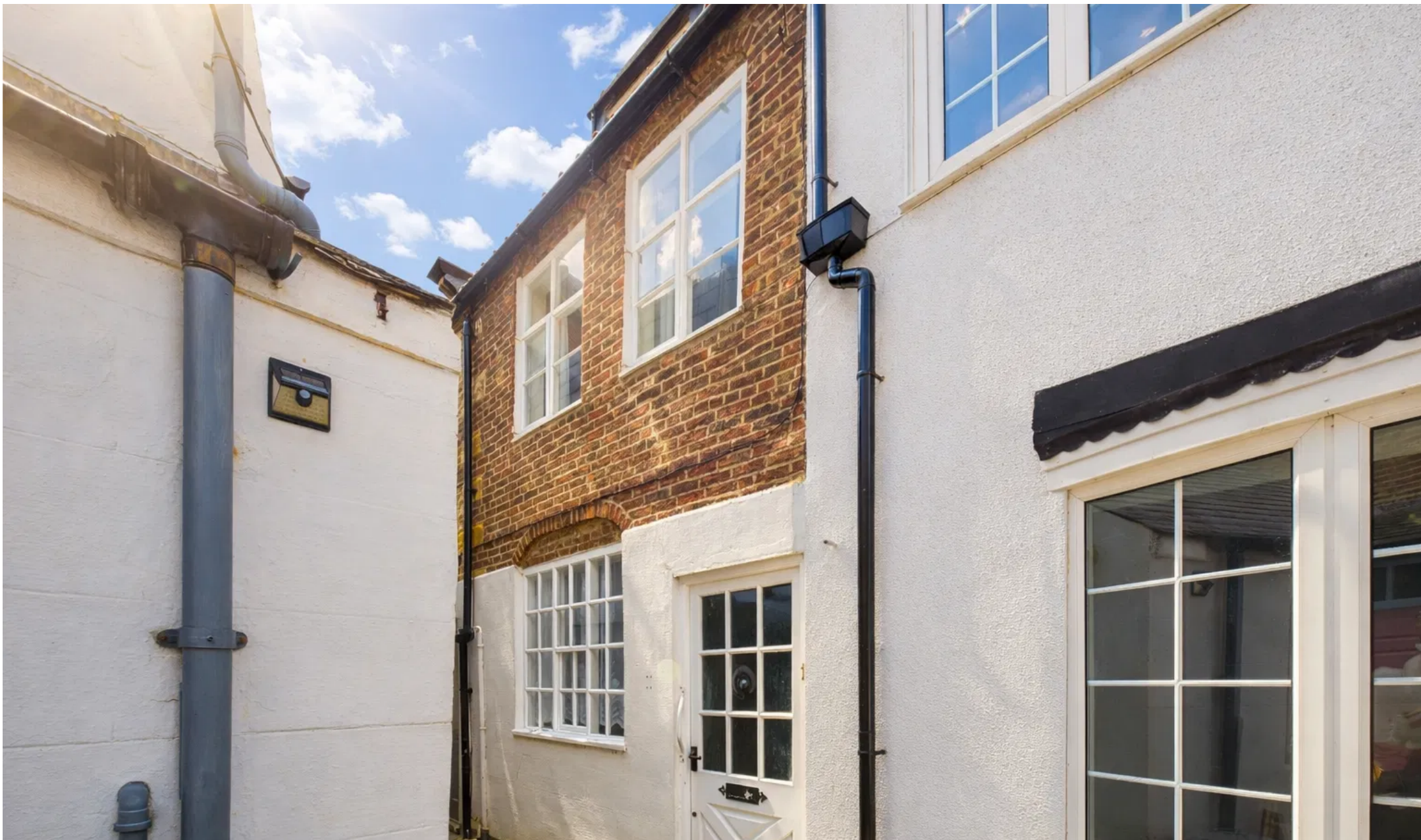
'Dots Cottage' 1 Gardiners Yard, Flowergate, Whitby Guide Price £169,950