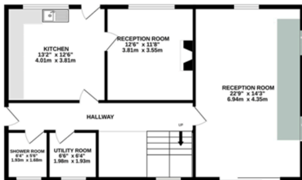
GROUND FLOOR 884 sq.ft. (82.1 sq.m.) approx.