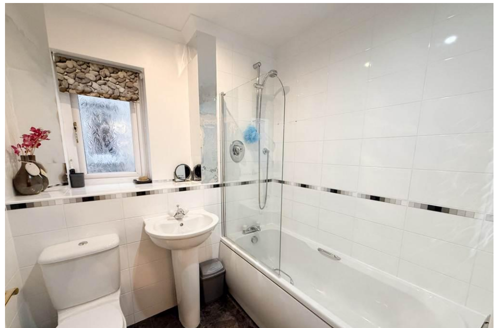
Next Home - 13 Hebridean Gardens, Crieff, PH7 3BP