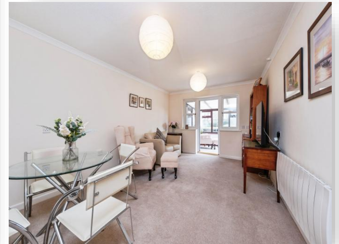
Abbotswood, Westbury Lane, Newport Pagnell, MK16 8PR