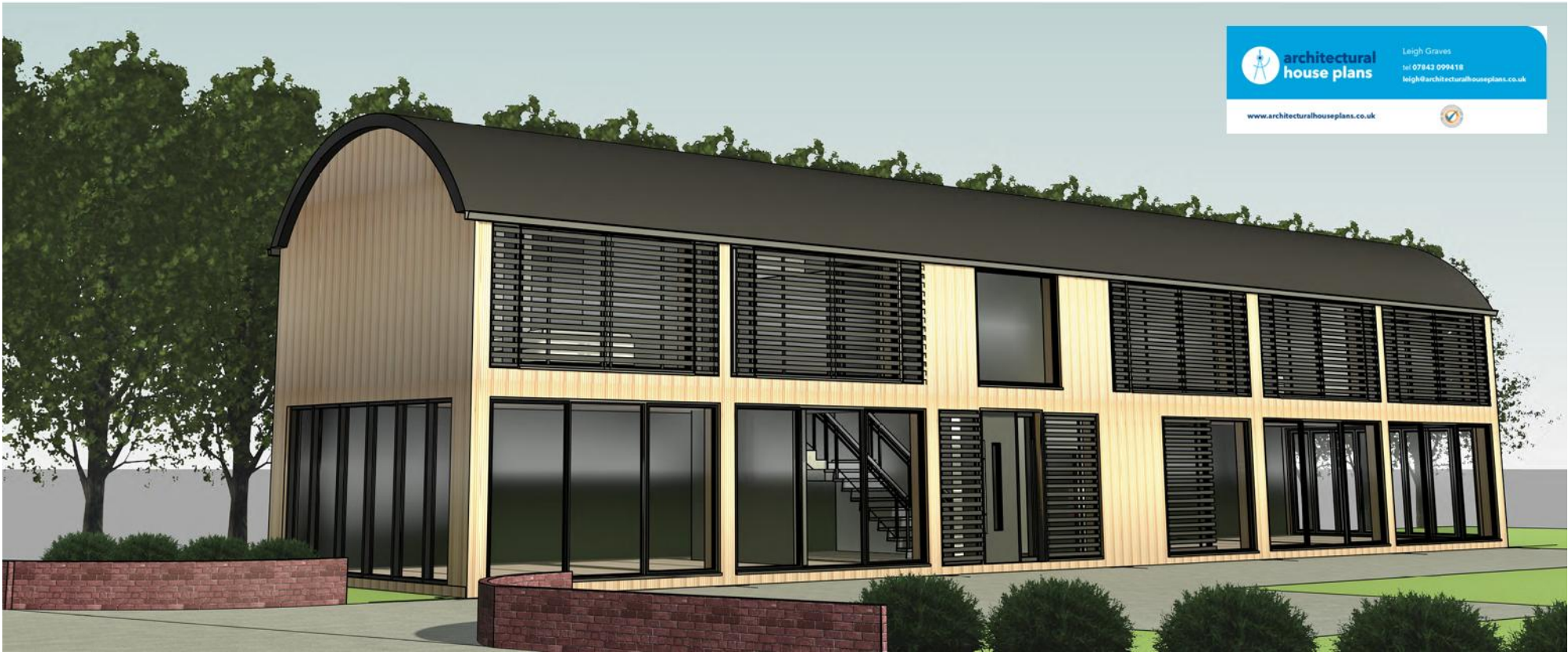
8 3D View 3