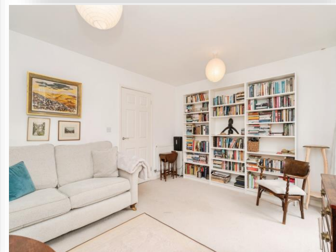
Oak Court Barons Close, Fakenham NR21 8FB