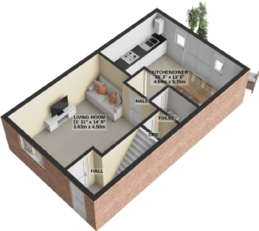
GROUND FLOOR 392 sq.ft. (36.4 sq.m.) approx.