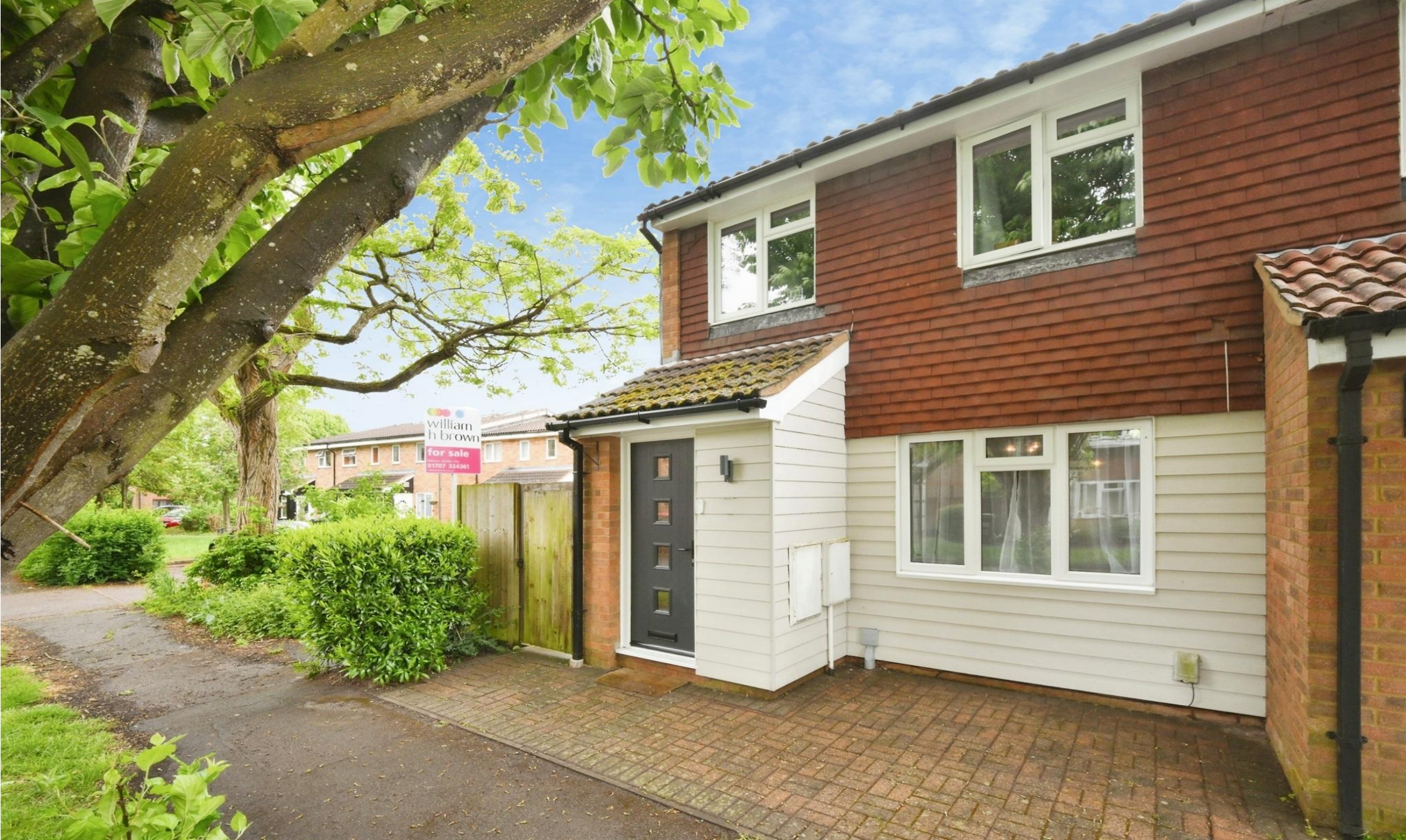
Wellington Drive, Welwyn Garden City AL7 2NF