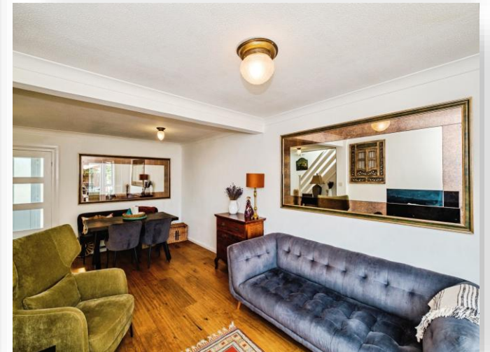
Freshbrook Road, Lancing BN15 8BL