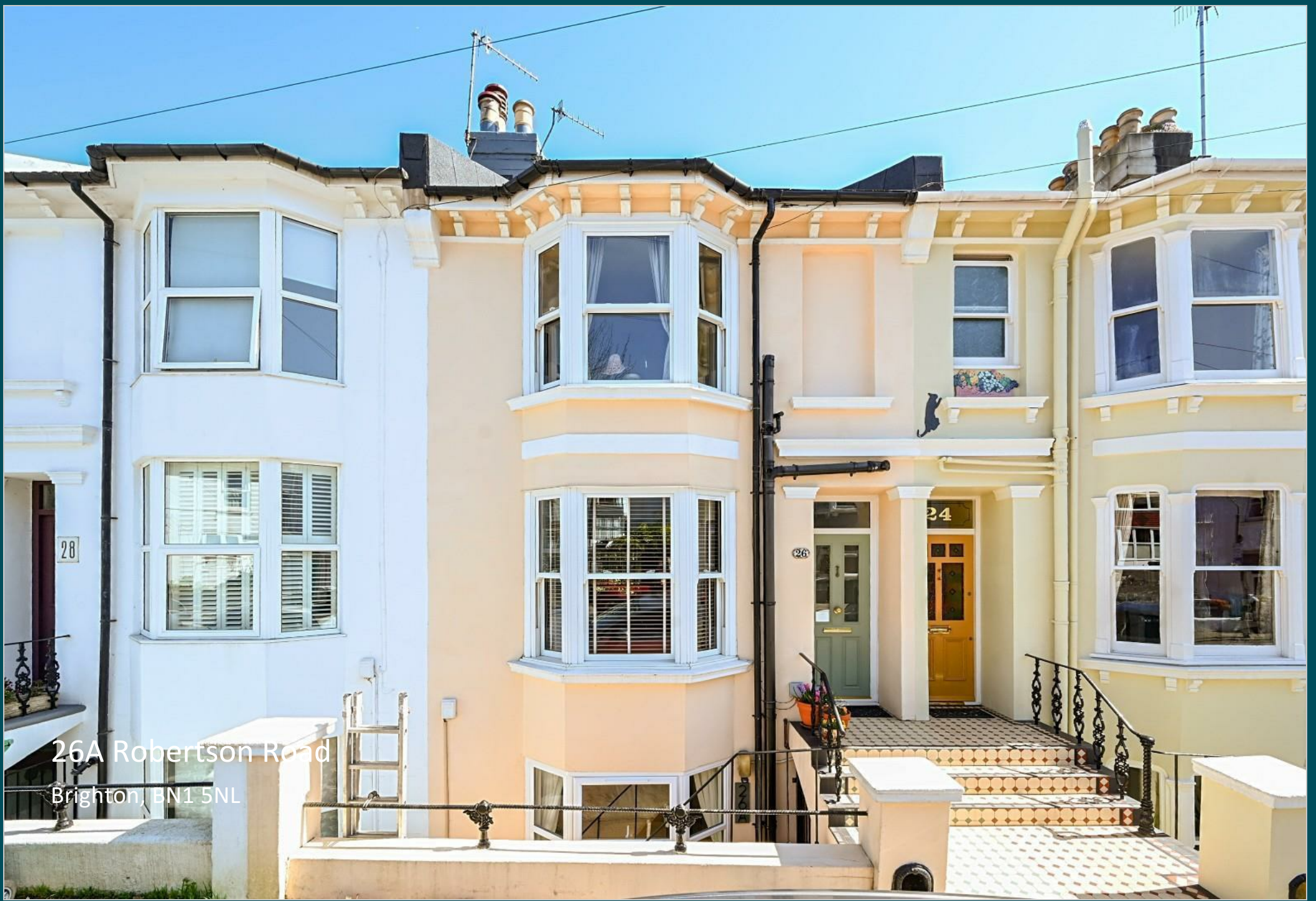
26A Robertson Road Brighton, BN1 5NL