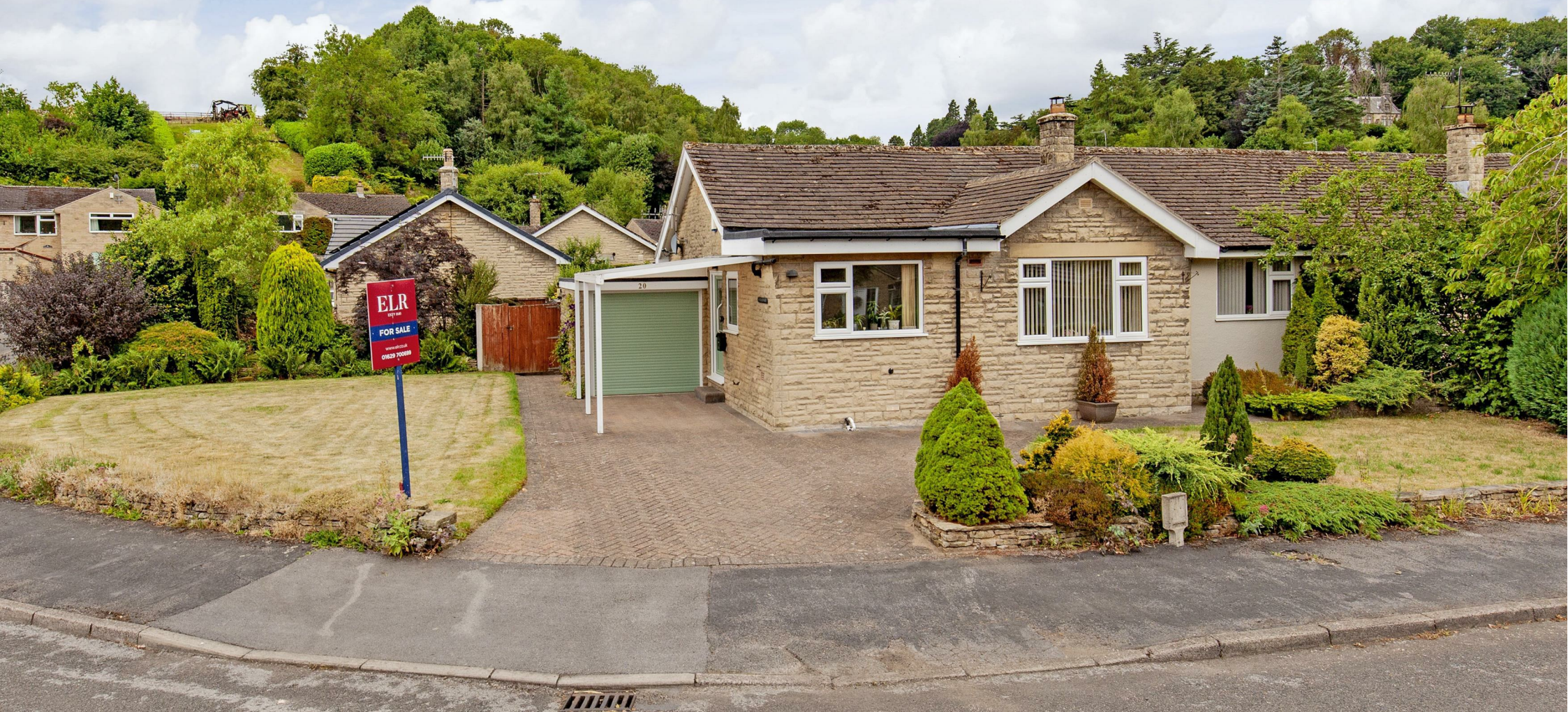
Sandalwood 20, Wyedale Crescent, Bakewell, DE45 1BE