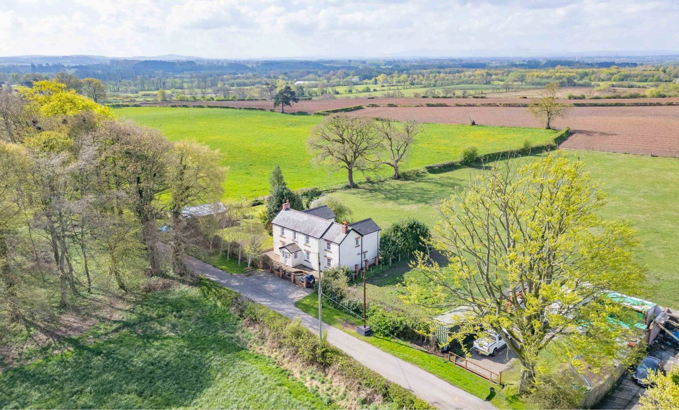
Moor Park House, Crosby Moor, Crosby On Eden, Carlisle, CA6 4QX Guide Price £475,000