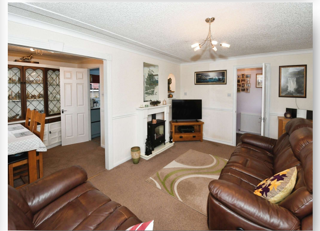
Hall Hills Park Norman Drive, Boston PE21 9SG