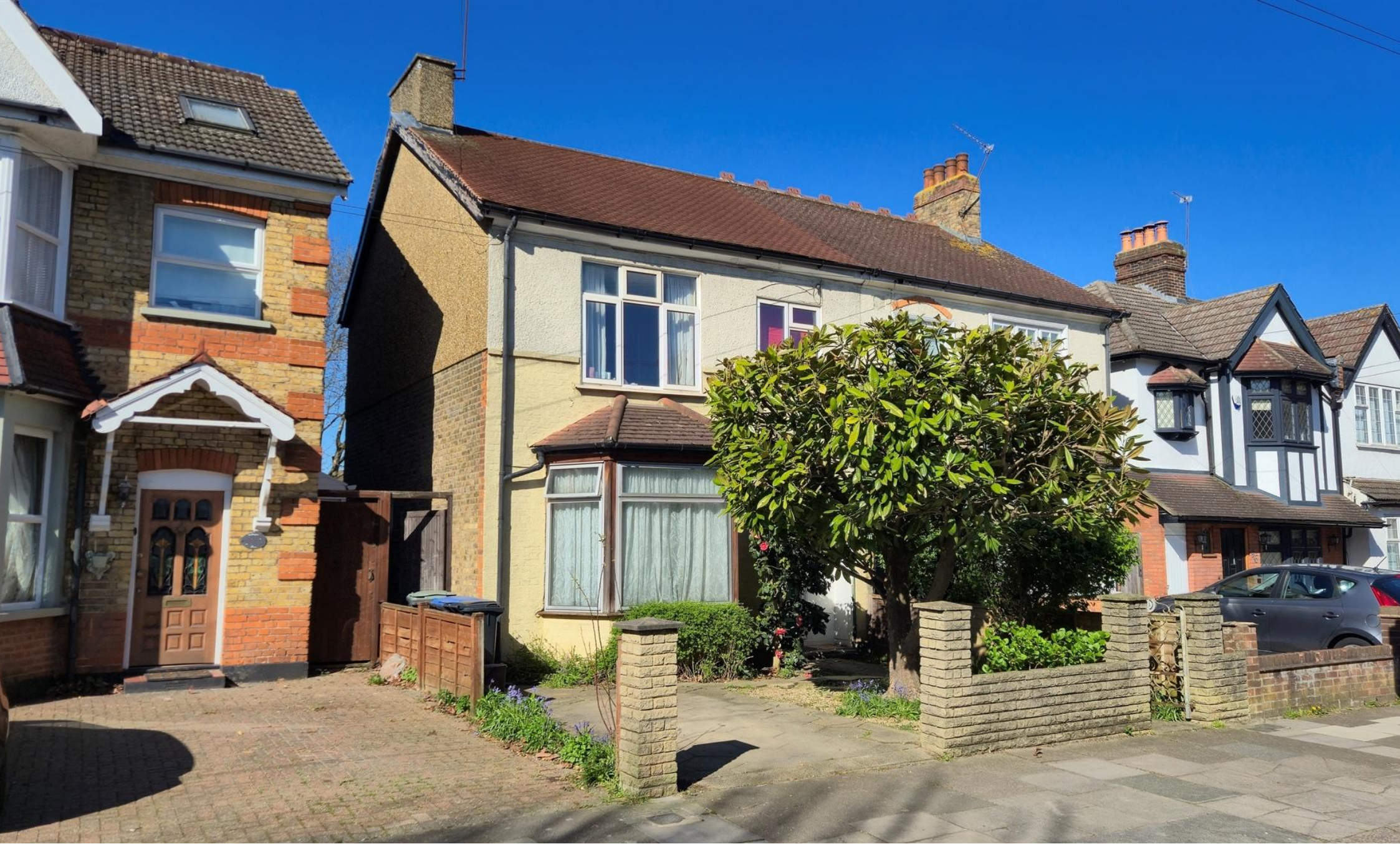
Wellington Road, Enfield, EN1 2RR