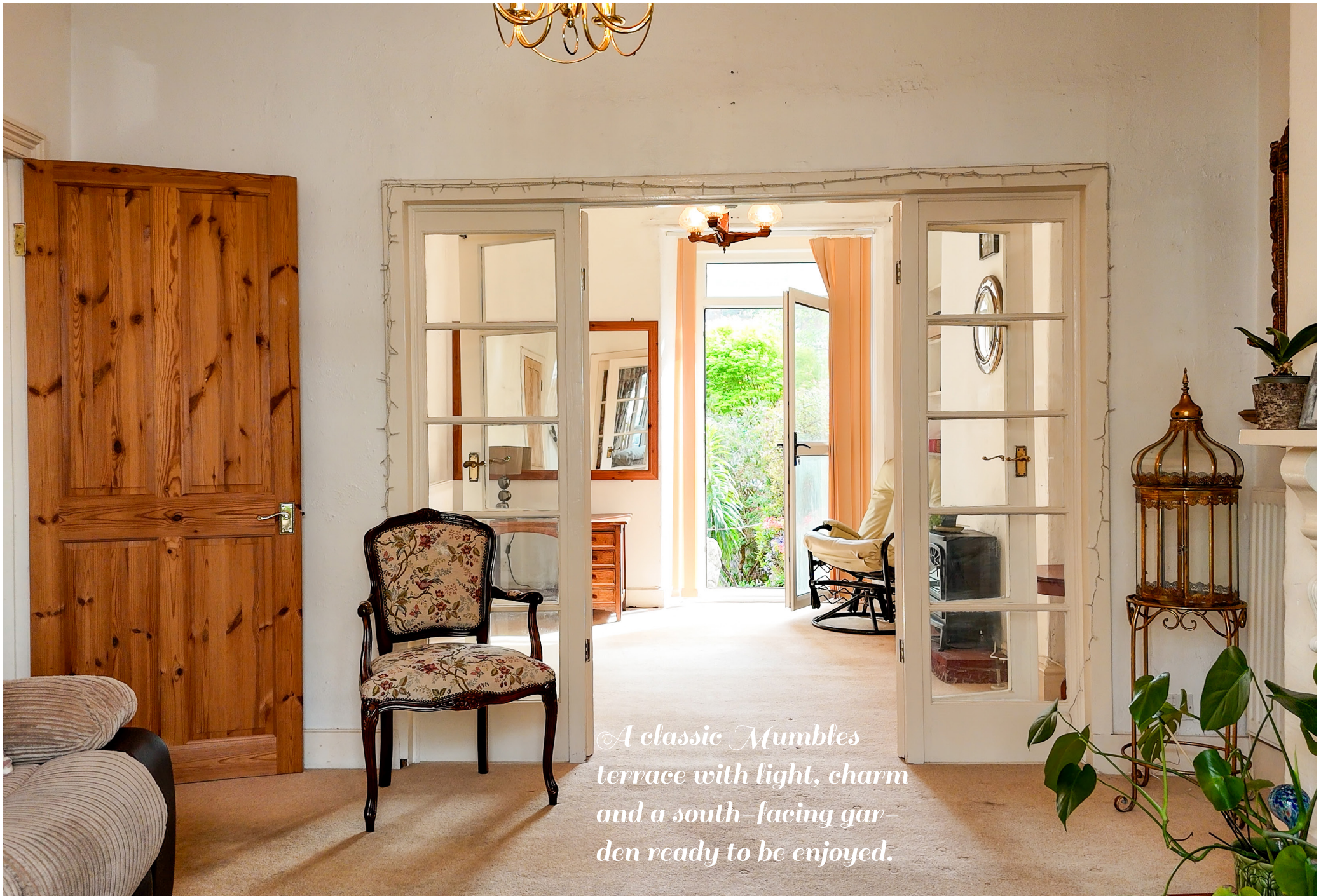
A classic Mumbles terrace with light, charm and a south-facing garden ready to be enjoyed.