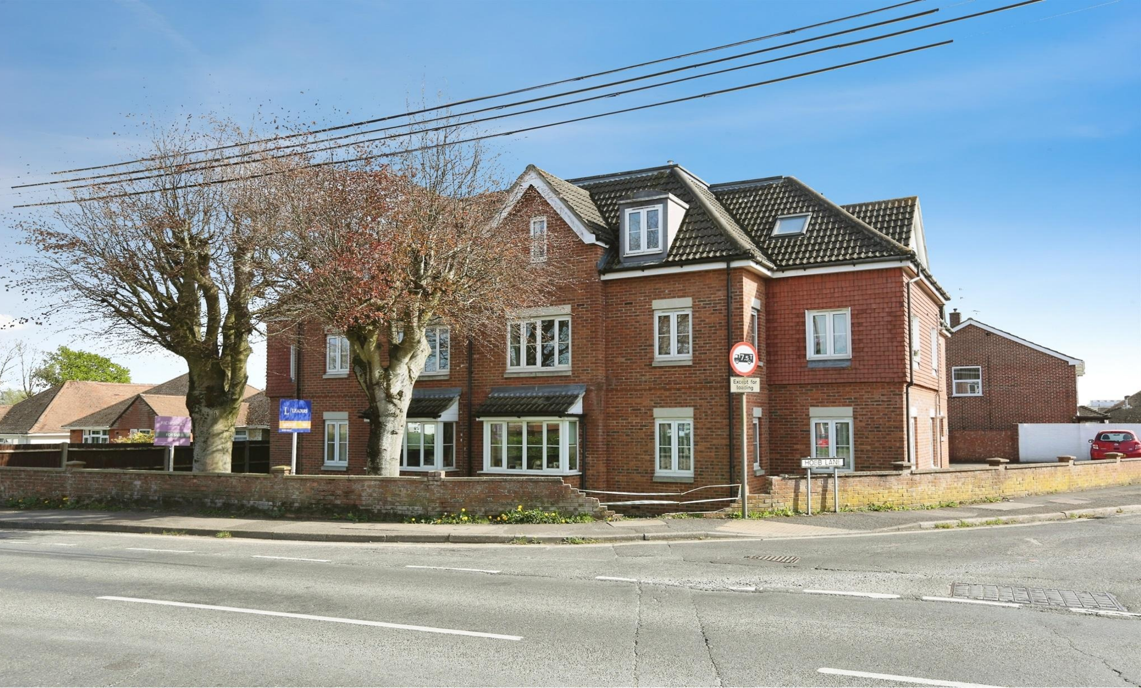
Copper Beeches House, Lower Northam Road, Hedge End, Southampton SO30 4BR