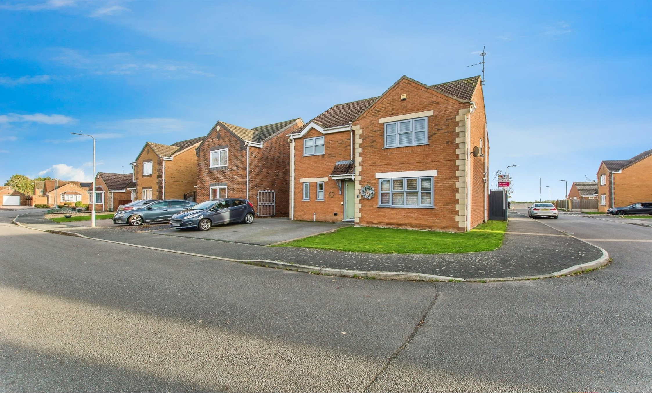
Lockton Close, Swineshead BOSTON PE20 3UD