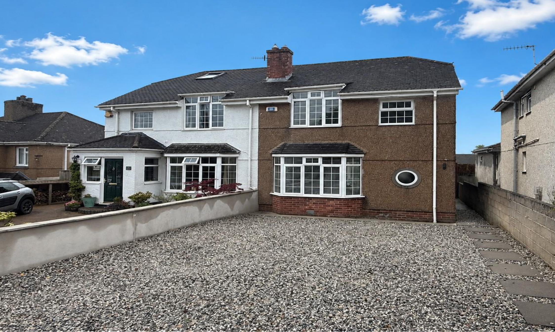
24 Hays Road, Elburton, Plymouth, Devon, PL9 8HR