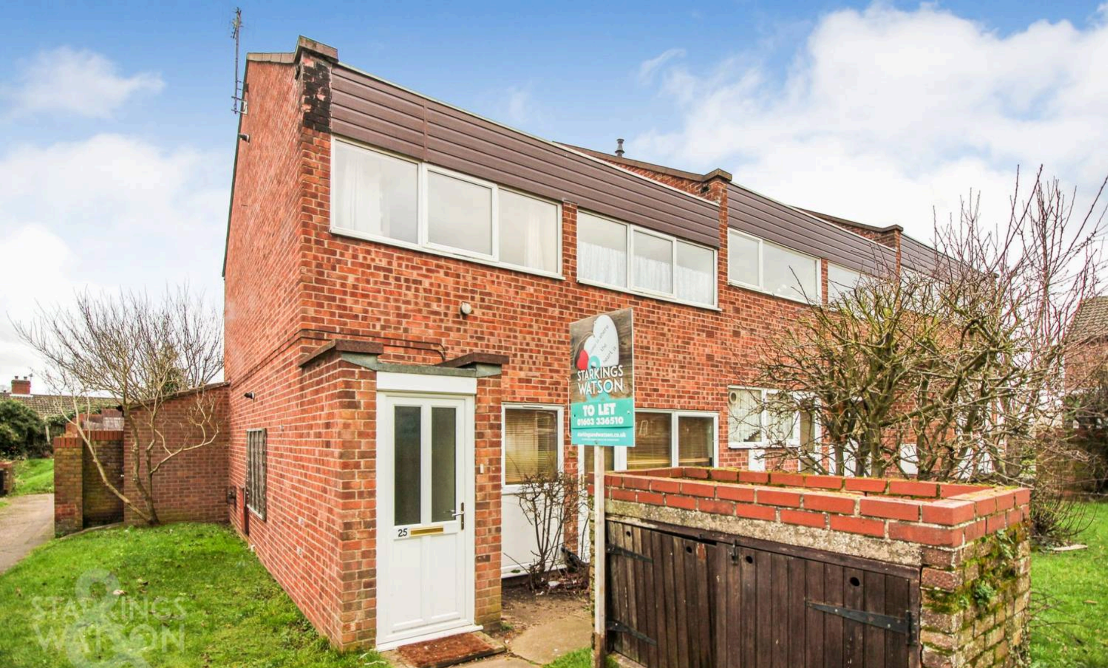
25 Windmill Court, Norwich - NR3 4ET