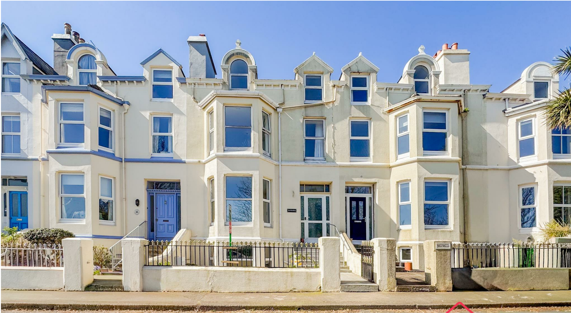
Heatherlea Windsor Mount, Ramsey, Isle Of Man, IM8 3EA Asking Price £419,950