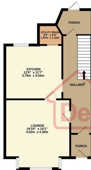
GROUND FLOOR 549 sq.ft. (51.0 sq.m.) approx.