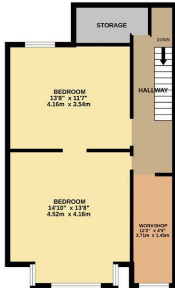
BASEMENT 524 sq.ft. (48.7 sq.m.) approx.