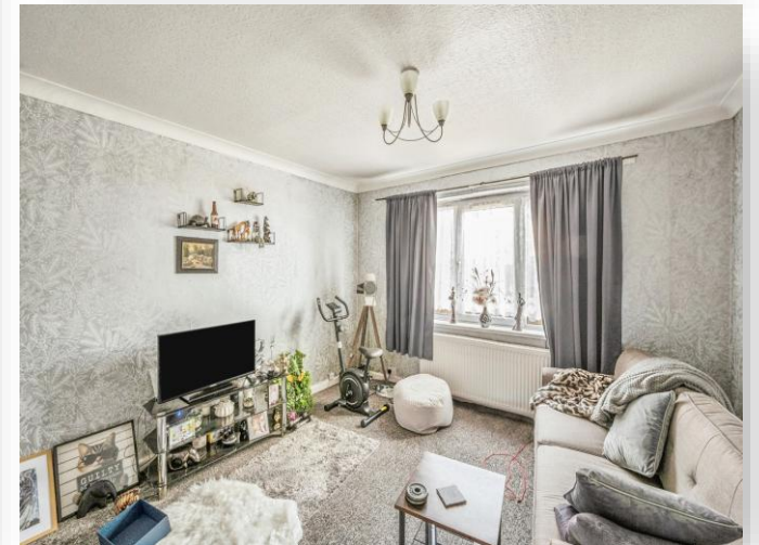
Butcher Street, Thurnscoe Rotherham S63 0RB