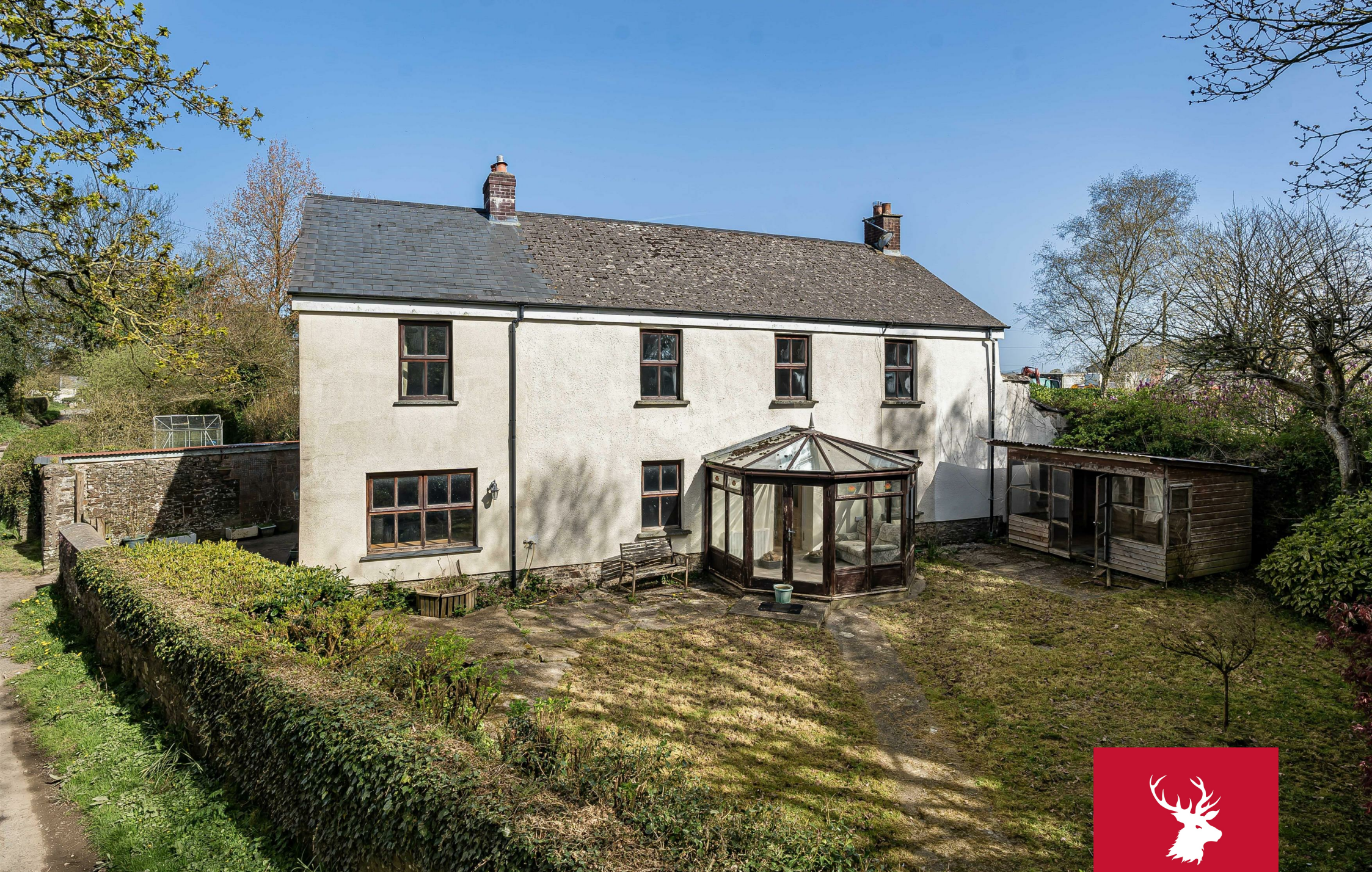
Ashley Cottage, Wembworthy