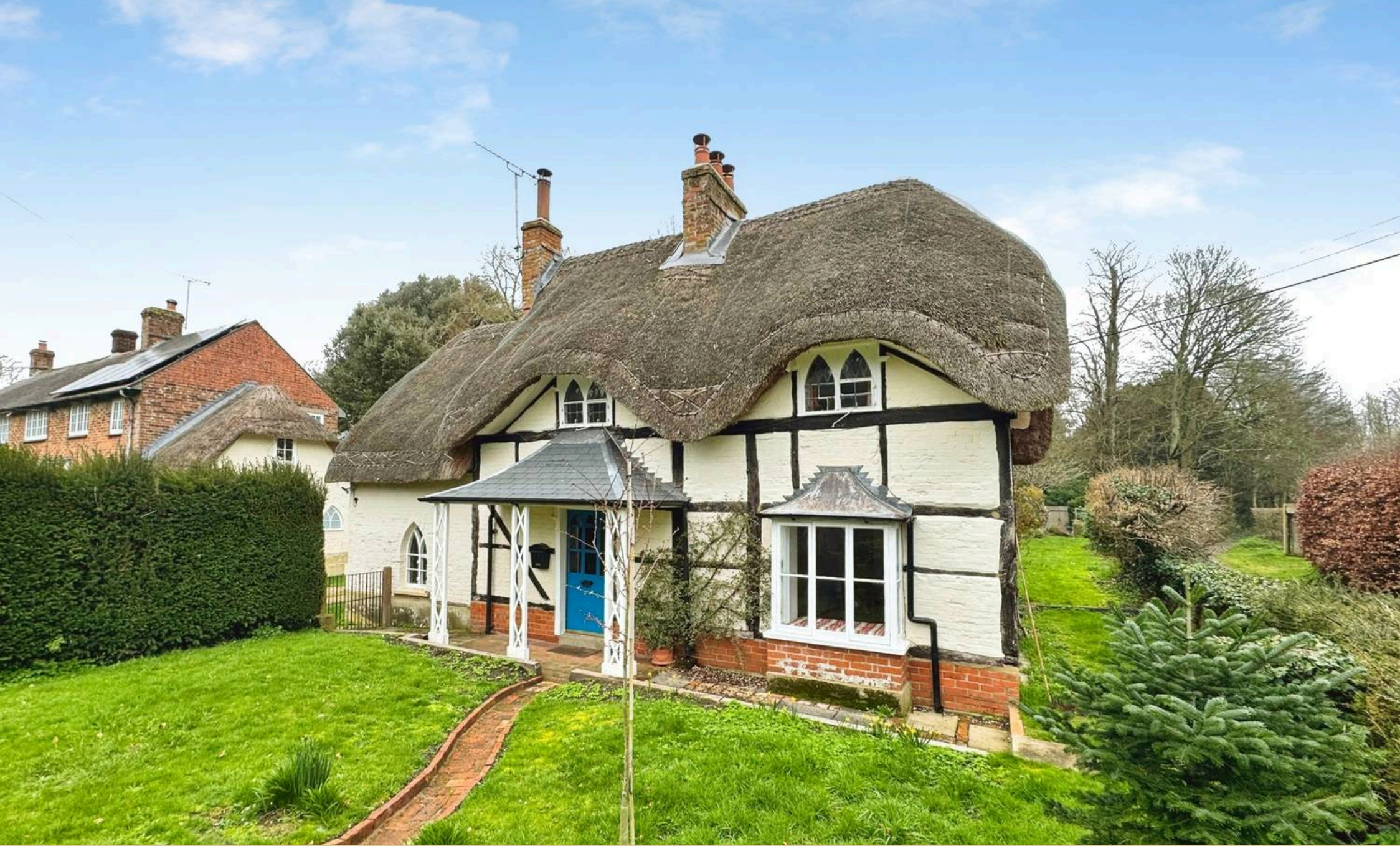
The Lodge, Conock Manor £2,000 pcm