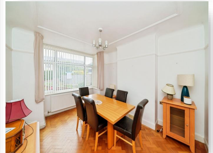
Hillcrest Drive, Greasby, Wirral CH49 3NL