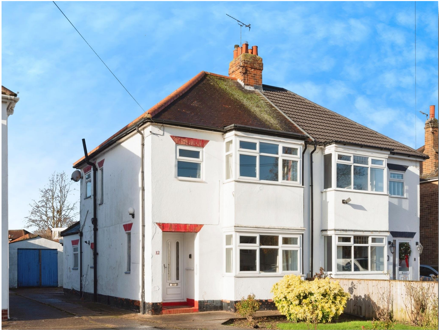
Lowfield Road, Anlaby HU10 7BU