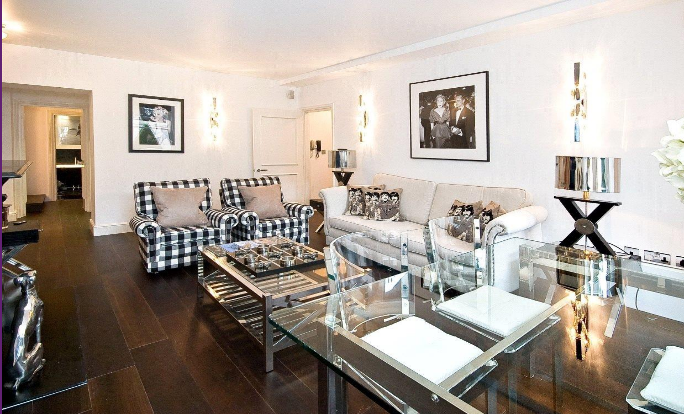
Rutland Court Rutland Gardens, SW7