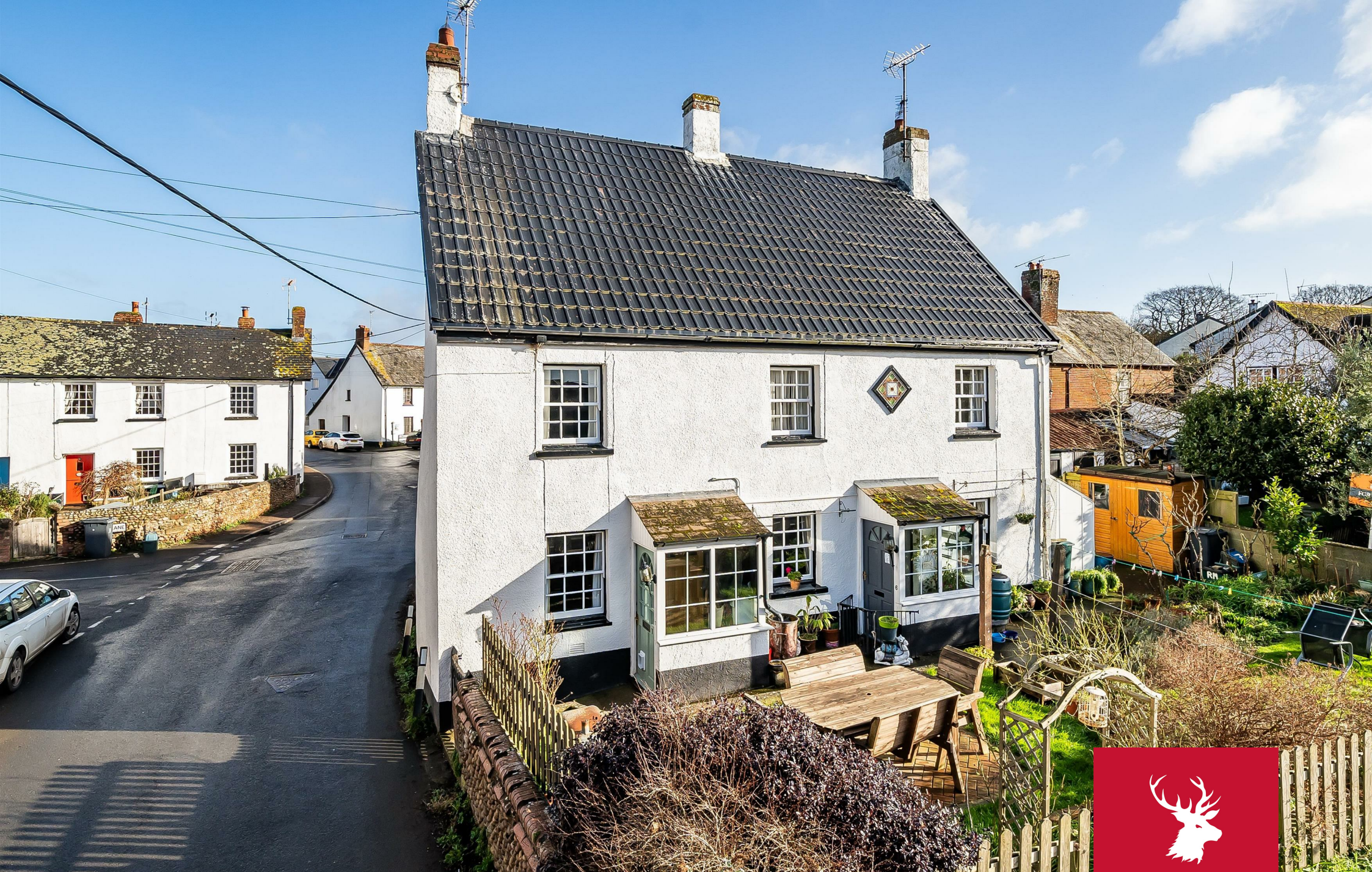
7 Thorns Cottages