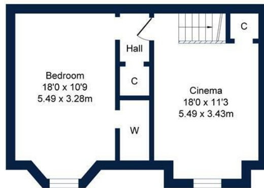
Lower Ground Floor Approx. Floor Area 437 Sq.Ft (40.6 Sq.M.)