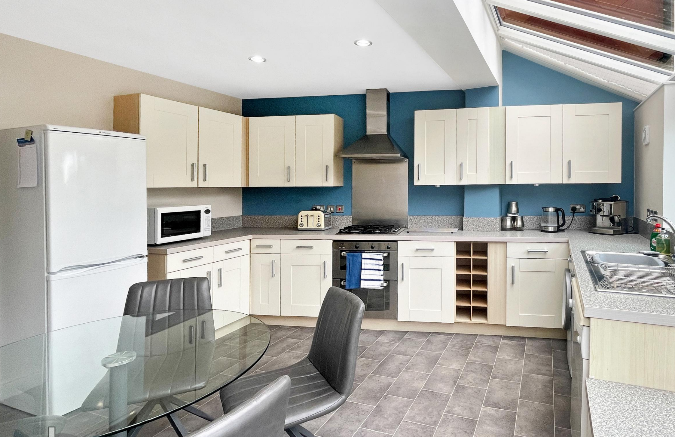
Rouse Way, Colchester, CO1 2TT