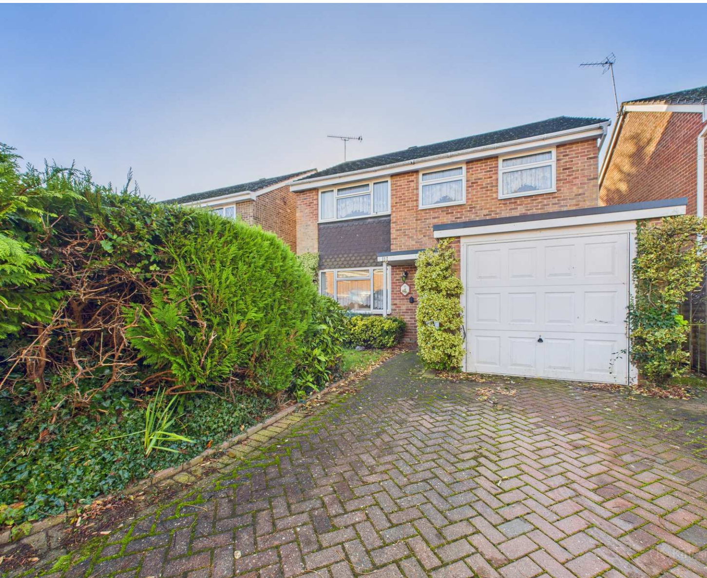
11 Tithe Close, Maidenhead, Berkshire, SL6 2YT