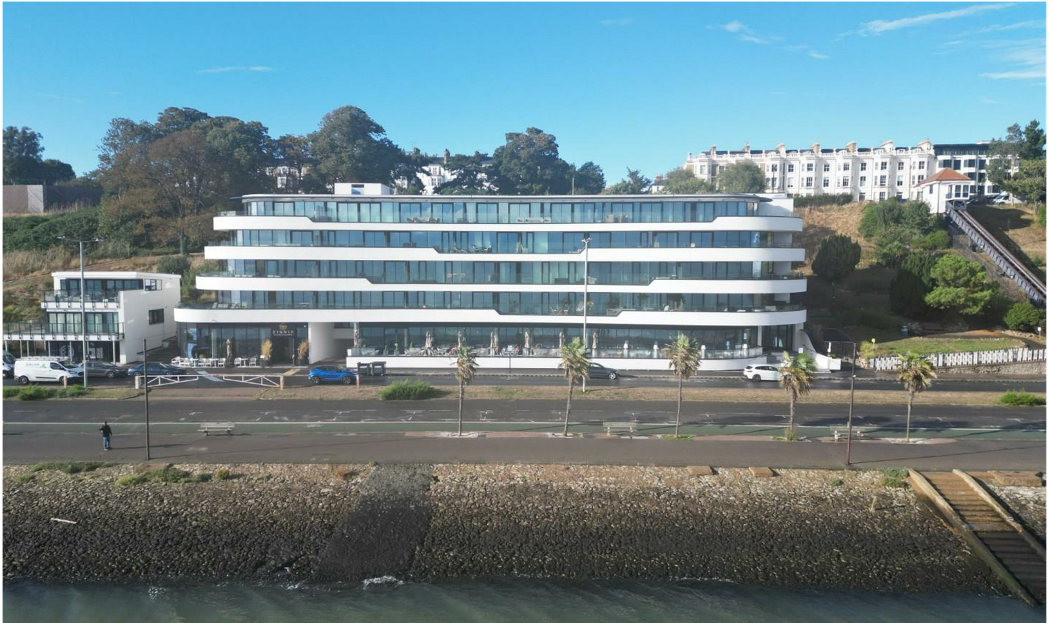
Clifftown Shore, Western Esplanade, £275,000