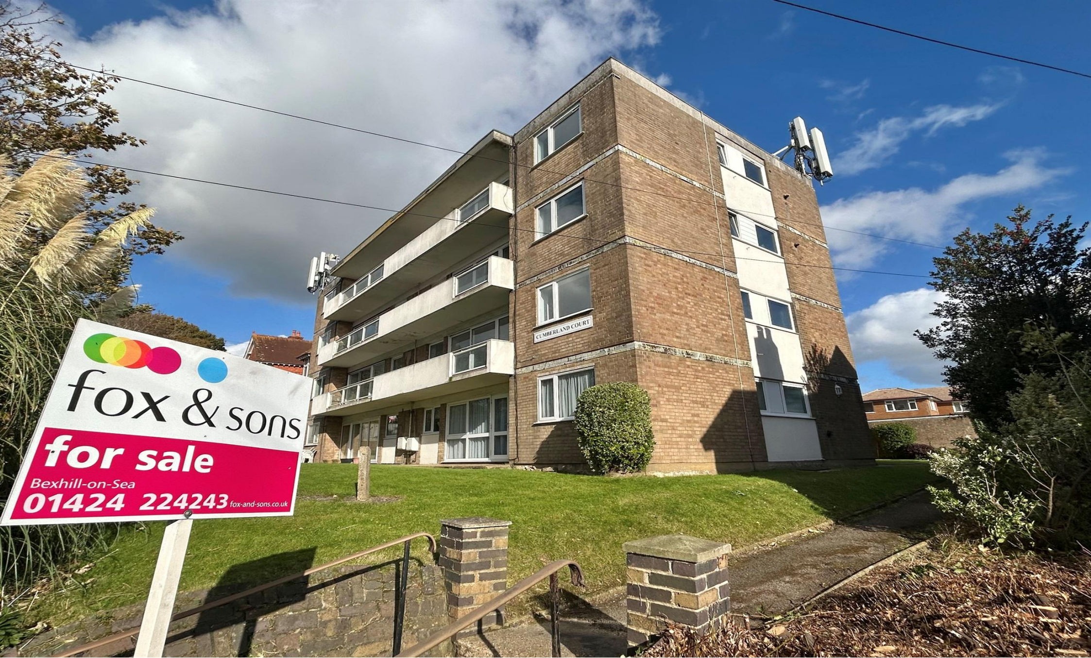
Cumberland Court - Upper Sea Road, Bexhill-On-Sea TN40 1RP