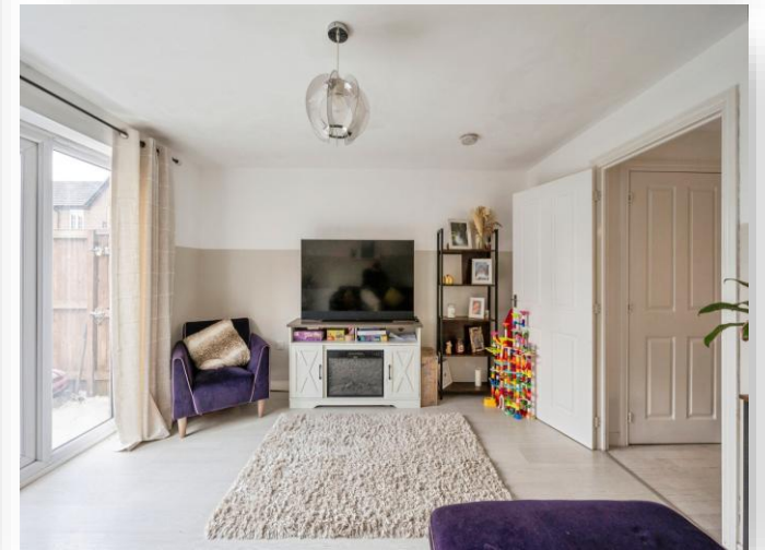
Falcon Close, Mexborough S64 0NU