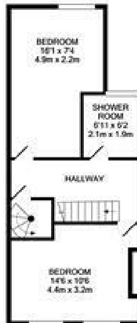
1ST FLOOR APPROX. FLOOR AREA 424 SQ.FT. (39.4 SQ.M.)

TOTAL APPROX. FLOOR AREA 1002 SQ.FT. (111.7 SQ.M.) Made with Metaplan (©2000)