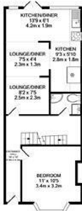
GROUND FLOOR APPROX. FLOOR AREA 580 SQ.FT. (53.4 SQ.M.)