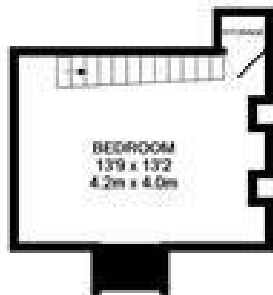
BASEMENT LEVEL APPROX. FLOOR AREA 149 SQ.FT. (13.8 SQ.M.)